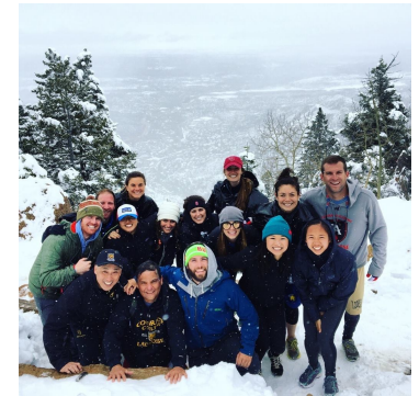
Top of the Incline