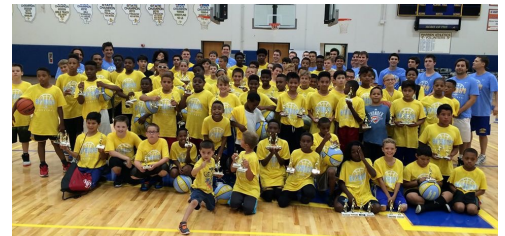
847 Hoops Campers