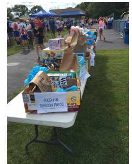
Beacon Place Food Drive