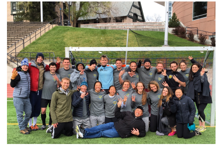
Quony Cup 2016

MTF offers assistance to children in need in Lake County. From a pair of glasses to a new coat, each of these needs is an emergency to the child and MTF is often their only hope.