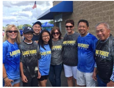
Family and friends at the LFHS Alumni Soccer Game