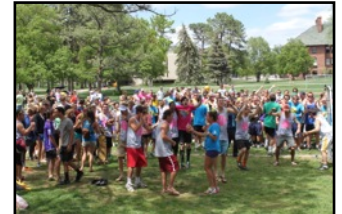
2013 Quony Cup