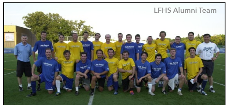
LFHS Alumni Team

IF YOU WOULD LIKE TO SUPPORT THE CHRISTOPHER QUON FOUNDATION... please send donations to: