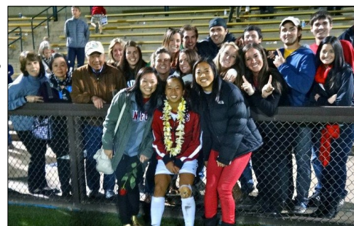
Family, LF and CC pals at Rachel's Senior Day!