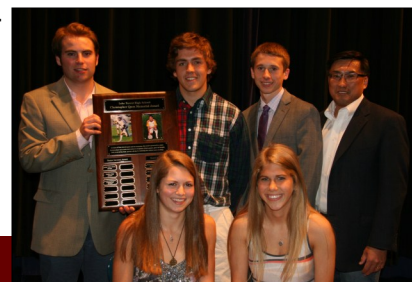
LFHS winners of CQF scholarships