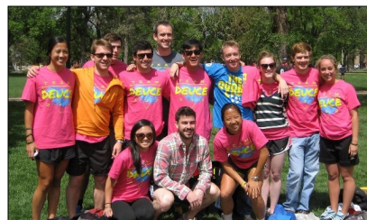
Team Deuce - the winners!