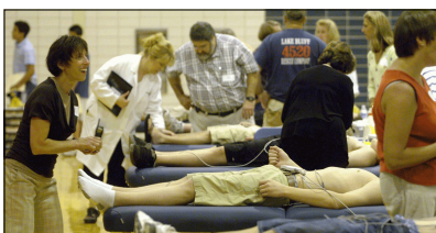
"Teens for Screens" testing at LFHS