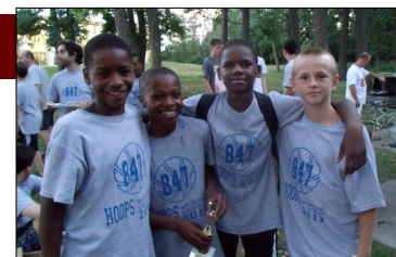
847 Hoops Campers