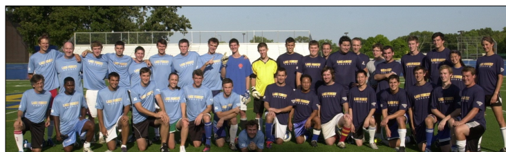
LFHS Soccer Alumni 2012