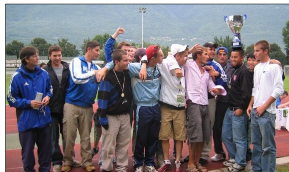
LFHS soccer team in Italy... Guess who has the trophy on his head?