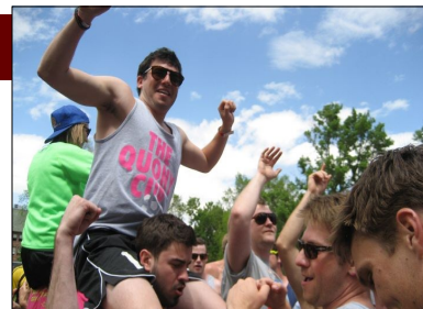
The Quony Cup dance!